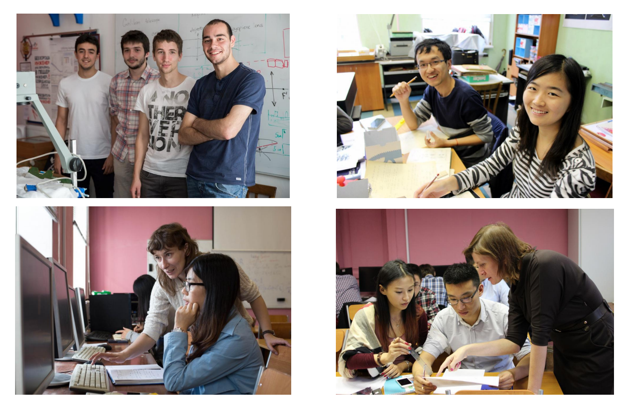
Figure 2 Students during the classes

For most cases SEPs includes 2 weeks for on-line training. The on-line part includes 2 modules for two weeks, theoretical (informational) case can be used as many times as needed, the evaluation (assessment) part includes tests with both theoretical questions and practical tasks and only 3 trials to pass it. After the successful passing this part students come to on-site training. During two on-site weeks they have both lectures with theoretical material and practical classes, usually on computers with special software for optical system modeling, mechanical design, etc. Also during these weeks they have some time to prepare the projects. On the last day of the on-site training they have to present they project. During the presentation they answer the questions of the teacher, lecturer and other students and get recommendations and comments. Figure 2 shows students during the classes; figure 3 presents fragments of students' projects.